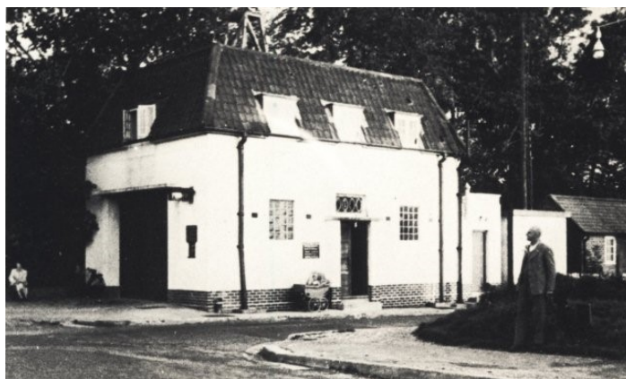
Old Fire Station 1950

Lessons learned during the early air raids of the war led to a national organisation, the National Fire Service, being formed and it took over from the District Council. In 1948, control of the Fire Brigade was handed back to the County Council and Hamble became part of Hampshire Fire Service. At this time the upper floor of the Fire Station became Hamble's library.