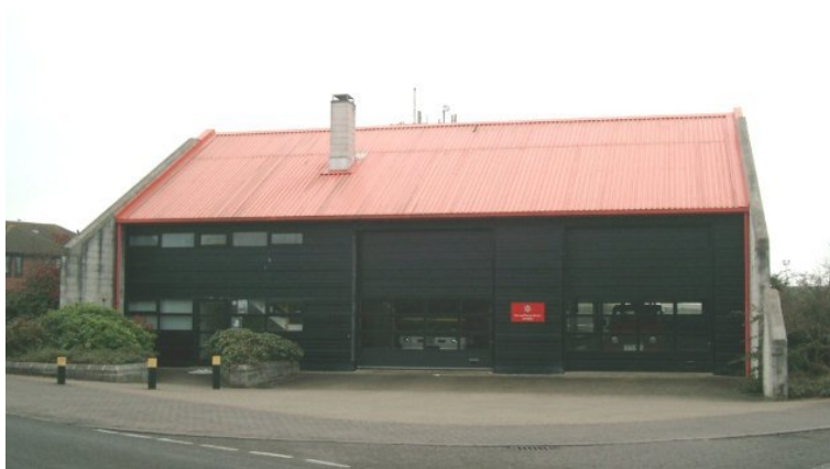
Hamble's Fire Station

To better reflect its current role, in 1992, the brigades name changed to Hampshire Fire and Rescue Service.