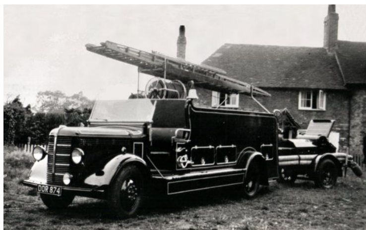
Hamble's first fire engine.